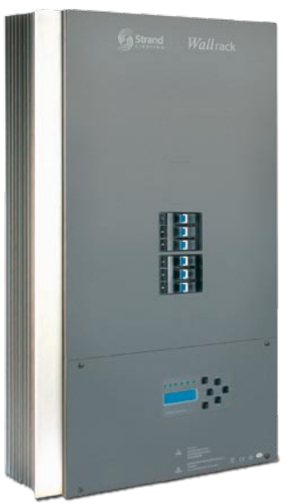
Wallrack 6 x 5kW cat. no. 75358