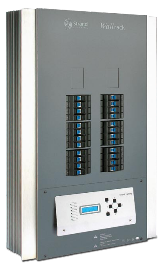
Wallrack 24 x 2.5kW cat. no. 75356