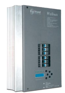
Wallrack 6 x 2.5kW cat. no. 75357

Use a 4-pole 60amp DIN rail mounting RCD, with DC pulse rating to upgrade the 6 \times 5kW Wall rack at time of installation. The 24 \times 2.5kW Wall rack requires two RCDs.